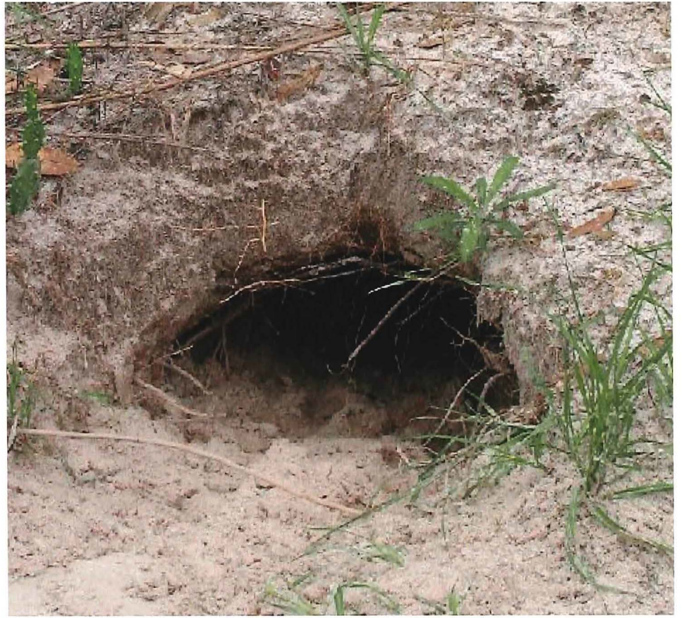
Gopher Tortoise Burrow

The gopher tortoise is protected under Florida law, Chapter 68A-27 of the Florida Administrative Code. Protect yourself and this imperiled species. Learn more at MyFWC.com/GopherTortoise or contact the nearest office of the FWC.