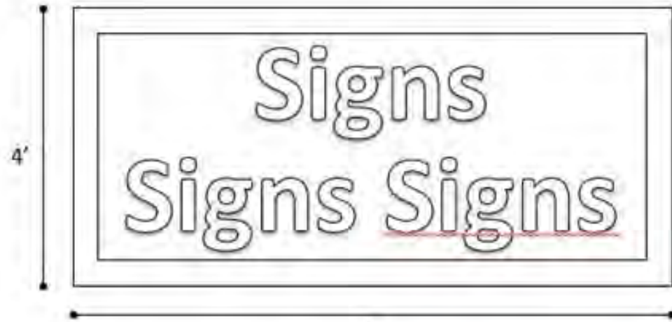
Sign Area = 32 s.f.