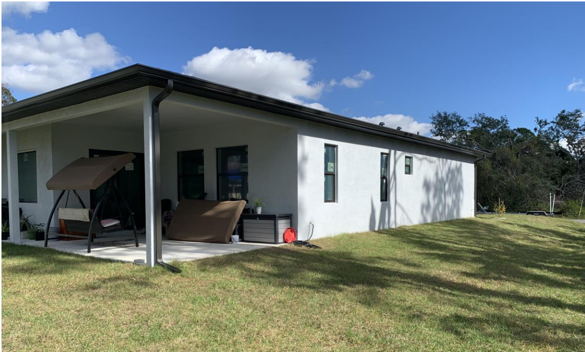
Photo 3 Caption Left View Date Taken 1/9/22

If submitting more photographs than will fit on the preceding page, affix the additional photographs below. Identify all photographs with: date taken; "Front View" and "Rear View"; and, if required, "Right Side View" and "Left Side View." When applicable, photographs must show the foundation with representative examples of the flood openings or vents, as indicated in Section A8.