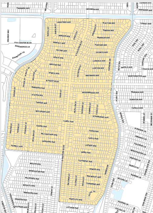
Map of Blue Ridge/N. Salford - Phase I