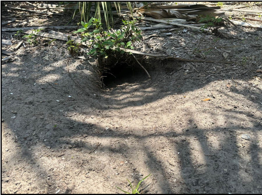
Gopher Tortoise Burrow #53 Potentially Occupied