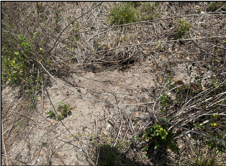
Gopher Tortoise Burrow #57 Potentially Abandoned