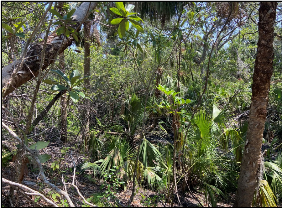
Representative Site Photo: Hardwood Conifer Mixed