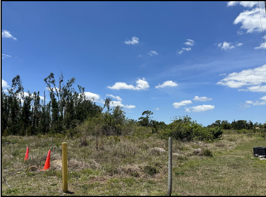
Representative Site Photo: Shrub and Brushland