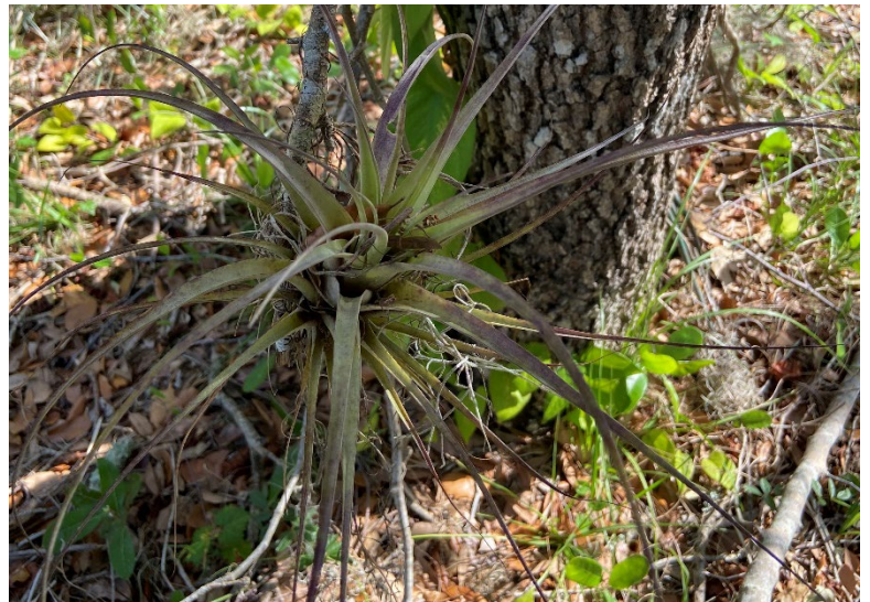
Giant Airplant found in central part of the Survey Area.