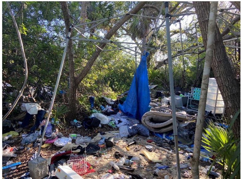
Several areas were covered in trash and some hazardous materials.

Numerous homeless encampments and dumpsites of yard and construction debris were encountered in Survey Area. This was most prevalent on the east side of the property, outside the park. Items within the encampments ranged from small items like clothing, household plastic containers, cans and other food containers, to large items like bicycles, mattresses, and furniture. Potential hazardous materials were discovered, including motor oil and discarded automotive batteries. One site, on the west side of the creek, was occupied at the time of the survey.