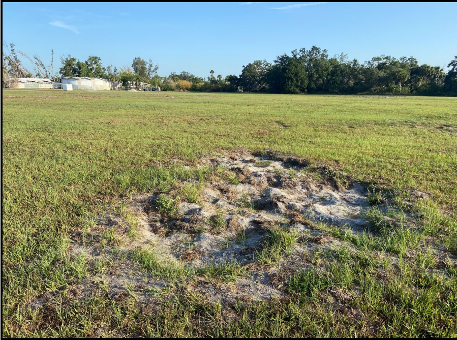
Representative Site Photo: Open Land