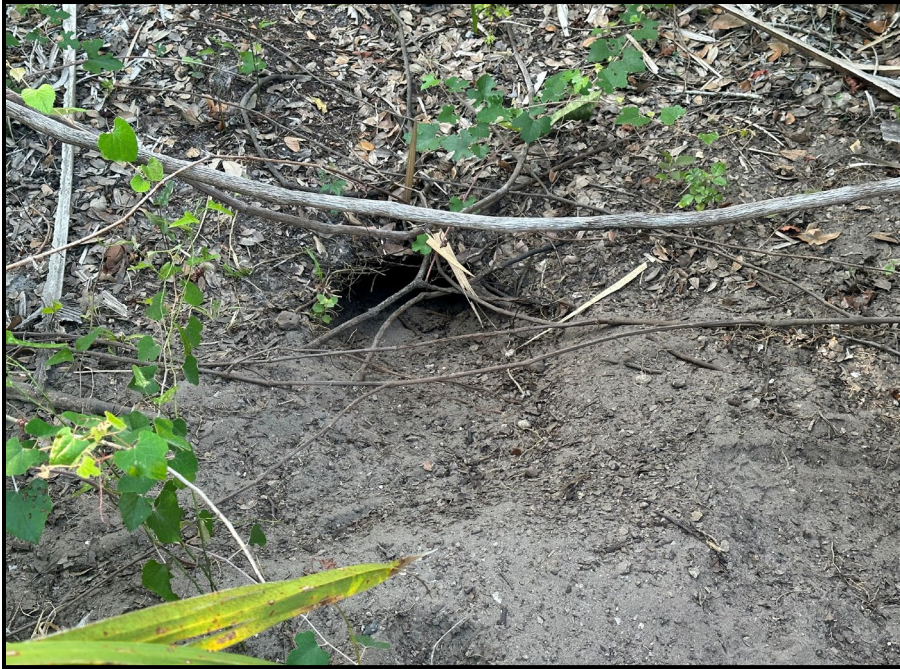
Gopher Tortoise Burrow #30 Potentially Occupied