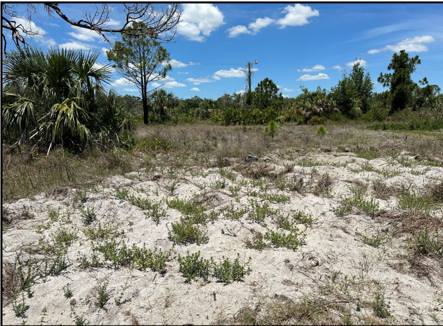
Representative Site Photo: Open Land