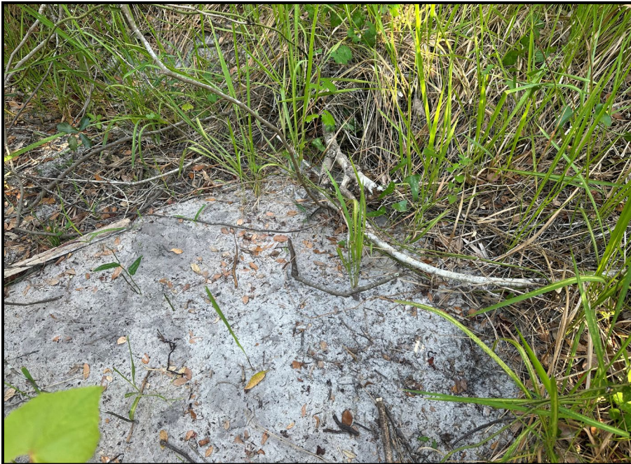
Gopher Tortoise Burrow #32 Potentially Abandoned