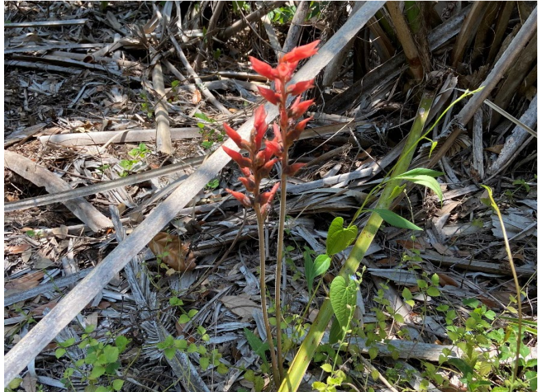
Leafless beaked ladiestresses found on eastern side of Survey Area.

Invasive and exotic plant species were also noted during the field inspection. The most commonly found invasive species were Australian Pine ( Casuarina equisetifolia ) and Brazilian Pepper ( Schinus terebinthifolia ). Large stands of Australian pine are present in several areas within the study area. This species shades and smothers native plants that grow nearby. Very little vegetation grows where this species is found. Brazilian pepper is another fast-growing species that crowds out native plants. This species is prevalent throughout central and eastern portion of the Survey Area. Table 3 lists the invasive plants observed during the field survey and their Florida Invasive Species Council rank. Category I species are invasive exotics that are altering native plant communities by displacing native species, changing community structures or ecological functions or hybridizing with natives. Category II species are invasive species that have increased in abundance or frequency but have not yet altered Florida plant communities to the extent shown by Category I species.