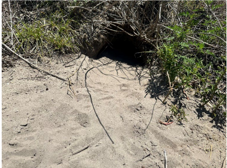
Representative burrow from the Survey Area.

In total, 109 gopher tortoise burrows were documented, with 88 burrows appearing potentially occupied and 21 burrows appearing abandoned. Each located burrow was marked with flagging tape, photographed, and the location was recorded with DGPS. Figure 1 shows a representative potentially occupied burrow. Gopher Tortoise population can be estimated by halving the number of potentially occupied burrows. This means that approximately 44 adult tortoises inhabit the property. A map depicting the locations of burrows and their status is included in Appendix C .